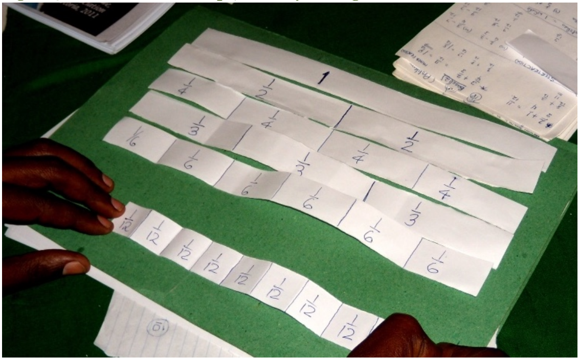
Figure 5: A set of fraction strips, made by folding