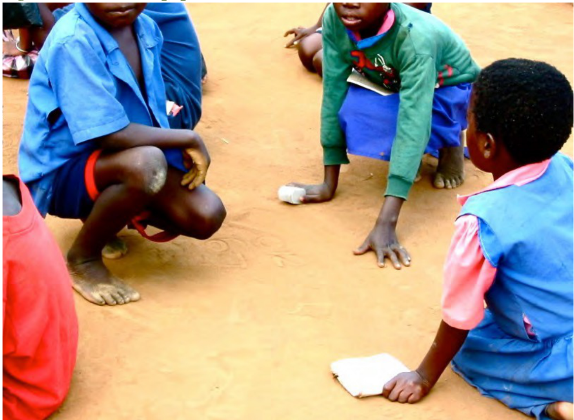
Figure 10: Standard 1 pupils write numerals in the dust

When choosing teaching methods to model to teachers in a country like Malawi, account should be taken of the culture and educational background of the teachers. They should also be methods that could be used by those teachers back in their own classrooms. The resources required to be successful in newly introduced teaching methods must be within the capacity of schools to afford and to organise. The paper models for mathematical concepts are inexpensive, and the cards used for puzzles and games are available in homes or easily made from paper.