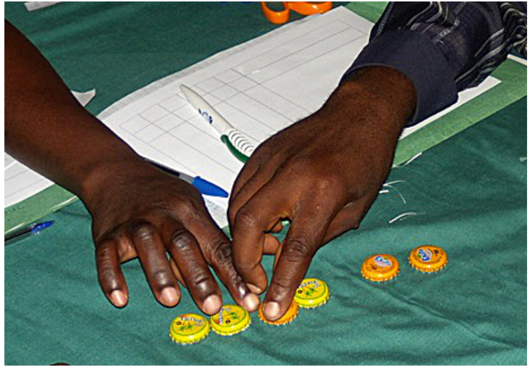
Figure 8: The kangaroos puzzle, leading to a quadratic function