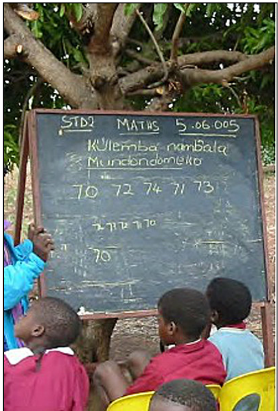
Figure 4: Teaching order of numbers in the outdoor shade

Teachers have successfully struggled through two years of secondary education, frequently in private fee-paying schools, and then had little preparation for teaching in a primary classroom. There is little support even for rote learning in the mathematics text books, and no support to help pupils (or teachers) understand any mathematics concepts. My research suggests that, in 2005, many Malawian primary teachers had very little understanding of basic concepts of mathematics, or even that such ideas exist. To get some notion of the mathematics performance of Malawian primary pupils, we may refer to comparative results (Sandefur, 2016). He has used statistical methods to compare results in TIMMS with roughly equivalent sub-Saharan national test results known as SACMEQ. In his ranking using the TIMMS grade 4 scale, the Malawian performance is second from the bottom of 61 listed countries, just above Namibia.