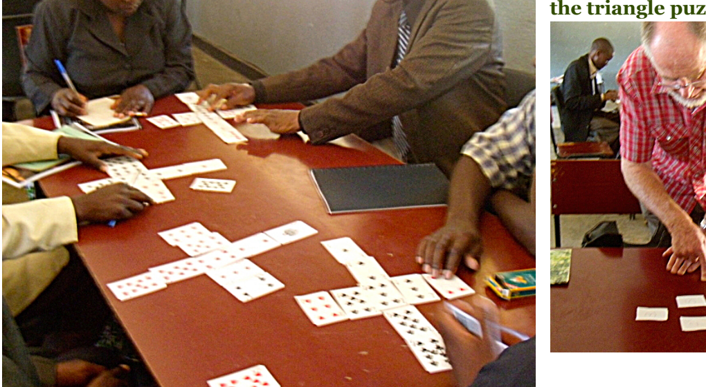
Figure 6: The total of the five cards horizontally and vertically must be the same

then challenged to find all solutions. They often choose a more systematic search. Finally, they are challenged to prove that there are no more solutions.