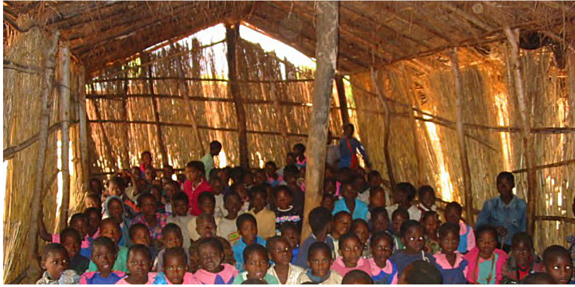
Figure 3: The back rows of a class of 150 Standard 1 pupils in a bamboo classroom

I returned to Malawi to share the results of my thesis, and for in-service courses for a few weeks each year between 2008 to 2014. The locations were in the four major centres: Zomba, Lilongwe, Mzuzu, and Blantyre. From my personal perspective this was an expensive program as it was almost totally unsupported. This was partly due to the Malawian expectation of being paid to attend courses. Organization of these week-long courses required the cooperation with the Association of Christian Educators of Malawi and various church education authorities.