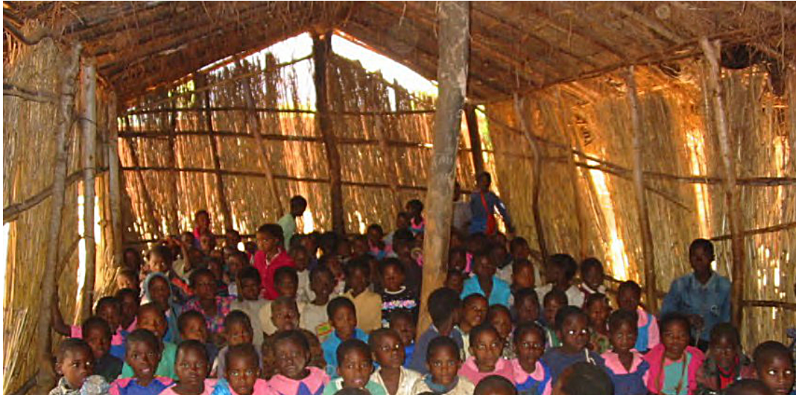
Figure 3: The back rows of a class of 150 Standard 1 pupils in a bamboo classroom

I returned to Malawi to share the results of my thesis, and for in-service courses for a few weeks each year between 2008 to 2014. The locations were in the four major centres: Zomba, Lilongwe, Mzuzu, and Blantyre. From my personal perspective this was an expensive program as it was almost totally unsupported. This was partly due to the Malawian expectation of being paid to attend courses. Organization of these week-long courses required the cooperation with the Association of Christian Educators of Malawi and various church education authorities.