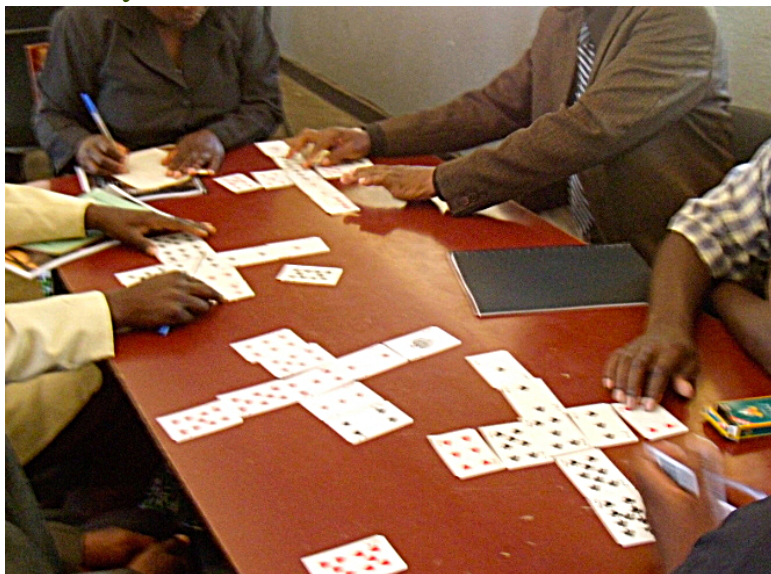
Figure 6: The total of the five cards horizontally and vertically must be the same