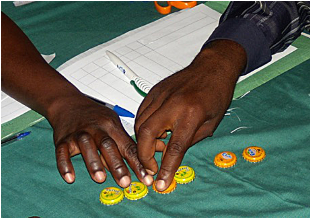
Figure 8: The kangaroos puzzle, leading to a quadratic function