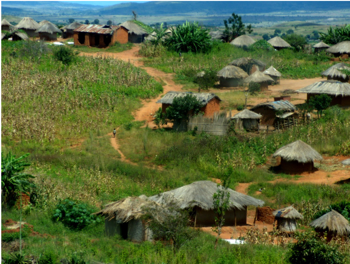
Figure 11: A roadside village in southern Malawi

Nothing about Malawi's history should avoid mentioning the HIV-AIDS epidemic. Malawi was second only to South Africa in the prevalence of the HIV-AIDS epidemic. The large numbers of children without one or both parents as a result of this disease causes stress, and distress, in the education system as well as the community as a whole.