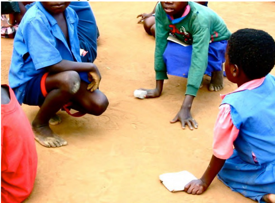
Figure 10: Standard 1 pupils write numerals in the dust

The methods should also allow teachers lacking conceptual understanding or skills to improve these while joining in with pupils in their activities. Above all, the methods should engage pupils (and teachers) positively in the experience of learning.